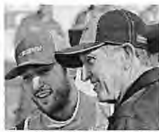
Chase Elliott and his father, Bill Elliott, share a moment Sunday in victory lane in Watkins Glen, New York. Bill won 44 NASCAR Cup races in a 37-year career.

At times, he looked lethargic, his head down and his step void of pep. He admitted he didn't have much control of his golf ball, and while he did all he could to correct his swing flaws, in the end he hit just 12 of 28 fairways in regulation on