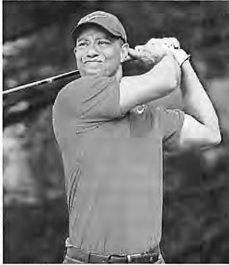
Tiger Woods tied for 31st in the World Golf Championships-Bridgestone Invitational with his second consecutive 73 Sunday.

the weekend and just 19 of 36 greens in regulation.