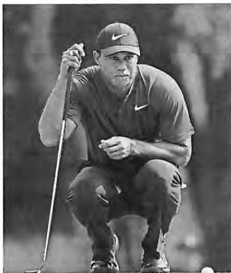
Tiger Woods lines up a putt on the 10th green during the final round of the PGA Championship.