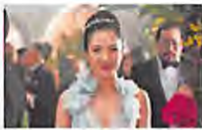
Constance Wu in "Crazy Rich Asians."

Breakout star Henry Golding told the Associated Press on Sunday that the film's performance is a "testament to the people who are turning up." "It's not just the Asians who are com-